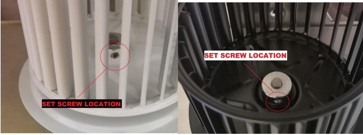
Fig 3 – Allen Key Insertion